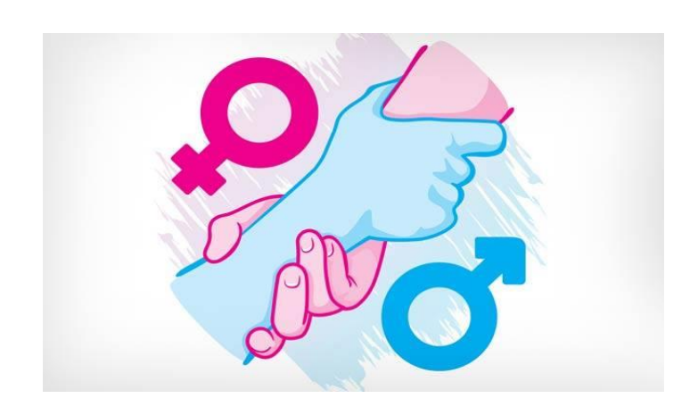
#Equality #GYLA #GenderQuota